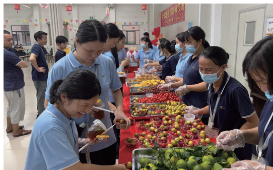
Employee Festive Events 員工節慶活動