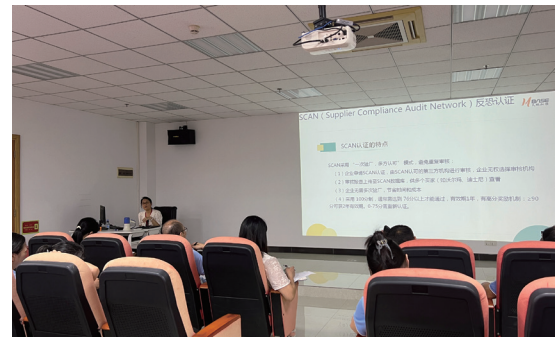
Training on Supply Chain Security 供應鏈安全培訓