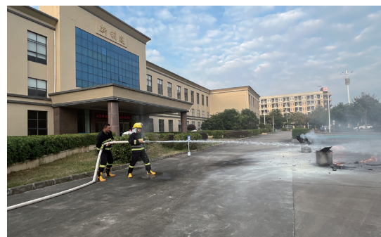
Conducting Comprehensive Fire Drill 開展綜合消防演練

During the Reporting Period, the Group provided training to 5,262 (2024: 7,032) participants. Total training hours were 10,163 hours (2024: 14,474 hours). Average training hours per employee were 13.20 hours (2024: 15.78 hours).