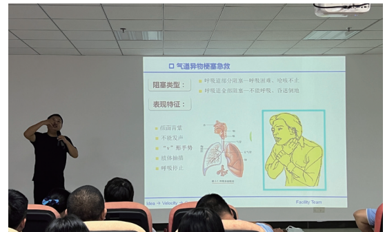
First Aid Training 醫療急救知識培訓