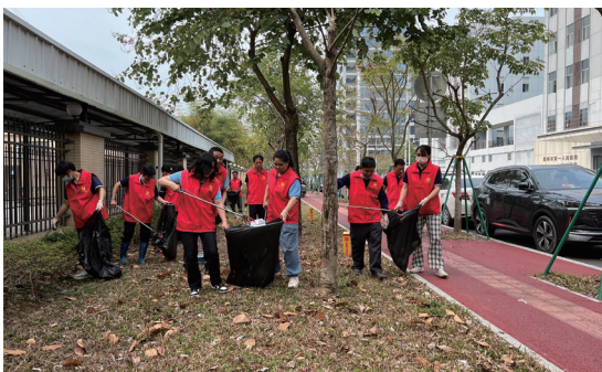
Organising a "Trash Run" activity for all employees 組織全體員工進行檢跑活動