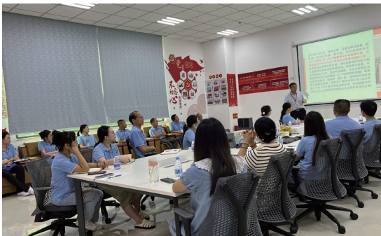
Legal Compliance Training 法律法規培訓