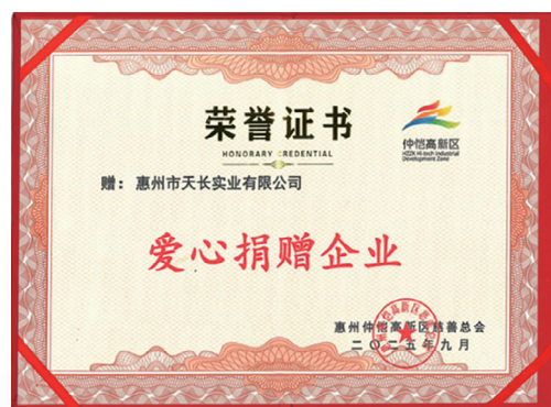
Awarded the "Caring Donor Enterprise" certificate 榮獲「愛心捐贈企業」證書