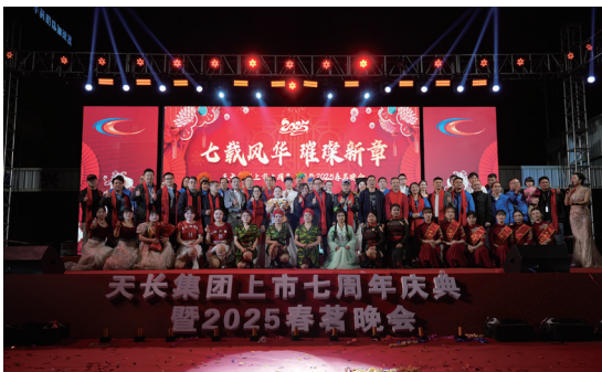
2025 Spring Gathering Evening Party 2025春茗晚會