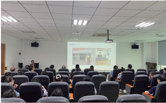
Training on AEO and Trade Security AEO貿易安全培訓