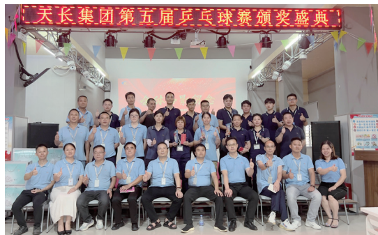
Employees' Table Tennis Tournament 員工乒乓球賽