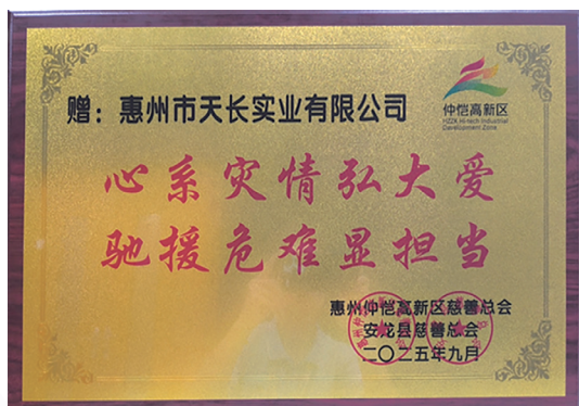
Awarded the plaque for supporting post-flood reconstruction 表彰集團在支援水災後重建之牌匾

通過積極參與當地社區，本集團能夠建立同社區之間的信任、增強本集團聲譽，並促進長期可持續發展。在環境、社會及管治倡議中參與社區活動有助於實現創造積極和包容的社會的更廣泛目標，同時與本集團的所有利益相關者的價值觀和期望保持一致。在未來，本集團將繼續投放更多資源回饋社會。